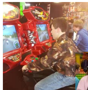
Middle school students enjoying their time at County Fair, joined to the Pizza Ranch in Brandon.

At the end of the day, the students got to go home for Christmas vacation, and agreed that the party was a great way to start their break!